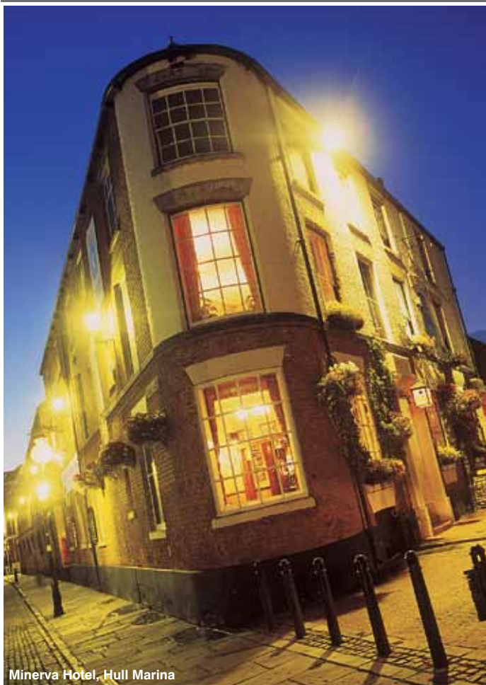
Minerva Hotel, Hull Marina

A pocket guide to the historical Old Town of Hull's traditional pubs and contemporary bars