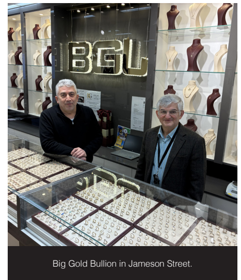
Big Gold Bullion in Jameson Street.

Big Gold Bullion is open Monday to Saturday from 10:00am until 5:00pm and has a wheelchair-accessible entrance. The store accepts major credit and debit cards, as well as contactless payments.