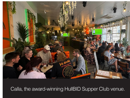
Calla, the award-winning HullBID Supper Club venue.

The HullBID Supper Club was launched in 2024 at Bilocca – the training restaurant at Hull College – with the aims of supporting the city centre's hospitality businesses and bringing together the wider membership for networking opportunities.