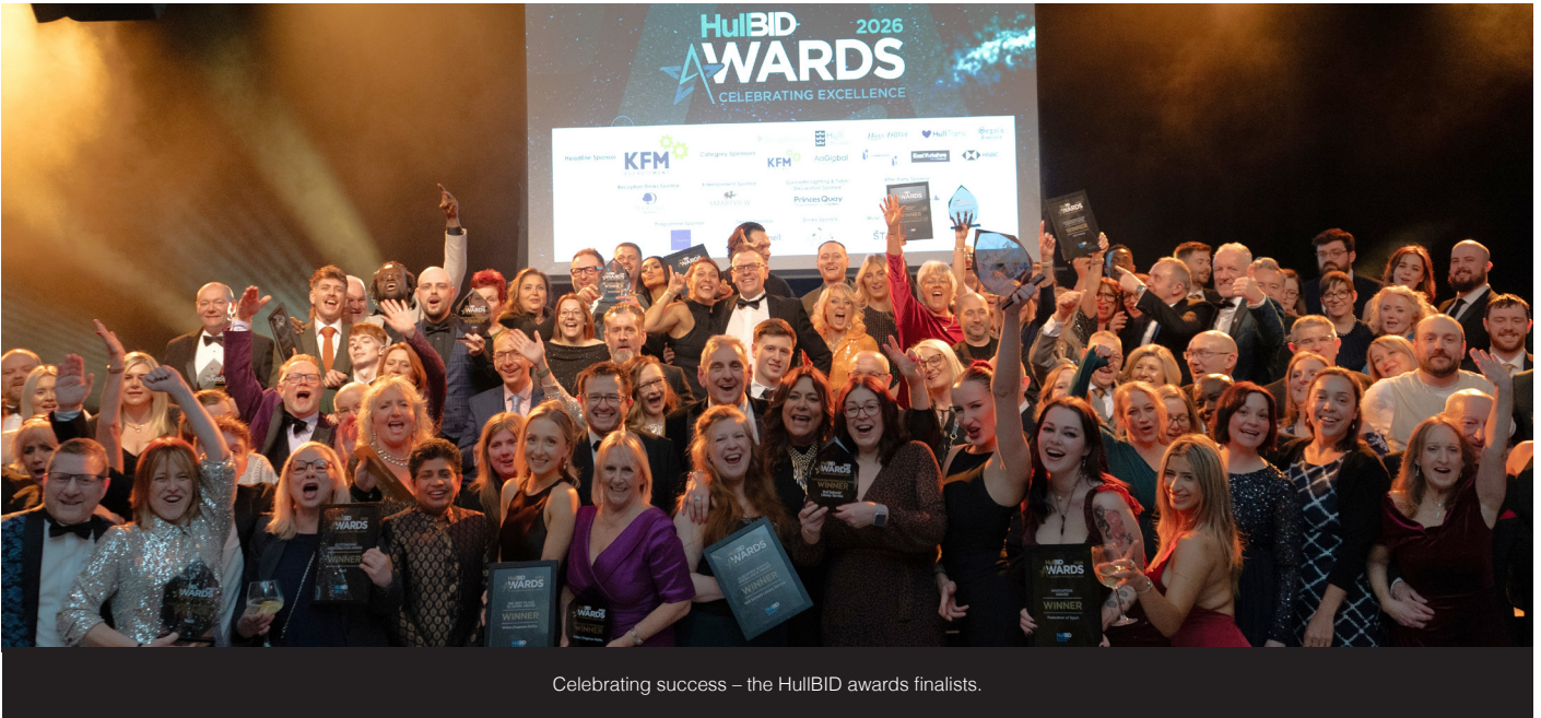
Celebrating success – the HullBID awards finalists.

City centre business community celebrating in style at HullBID Awards 2026